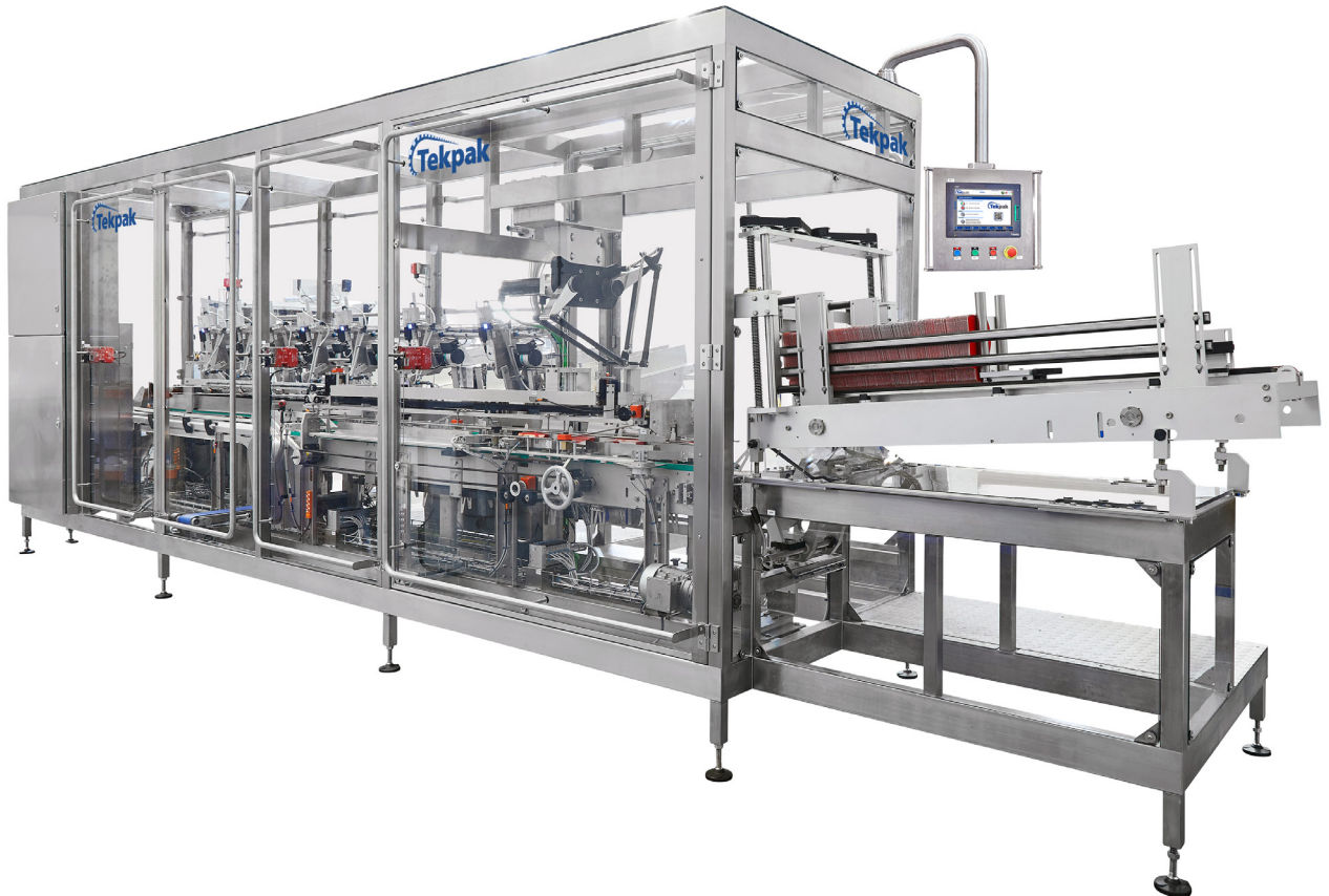
Horizontal Cartoner- Typical Configuration

The Horizontal Cartoner is the ideal flexible system for loading single or multiple flow wrapped pharmaceuticals, food products or medical devices into cartons with high throughputs or in multiple formats.