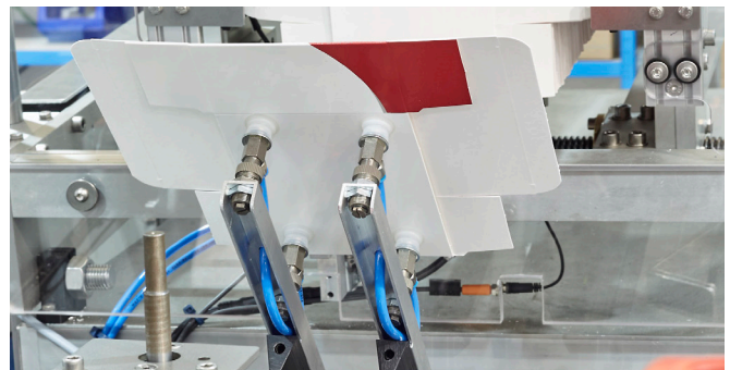
Carton Take Down Module