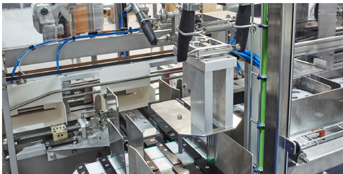
2-Axis Robotic Side Loading of Product