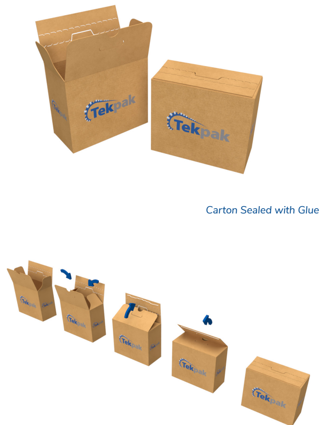
Carton Closing Sequence with Glue