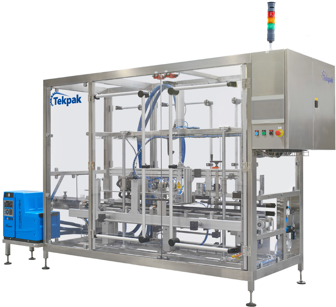
Carton Closer- Typical Configuration

The fully automated Carton Closer is configurable for fold & tuck or hot melt glue style closing and is ideal for retail display or shelf ready cartons. The built in carton transports system guides the open carton through folding of the top minor and major flaps before tuck closing or closing with hot melt glue.